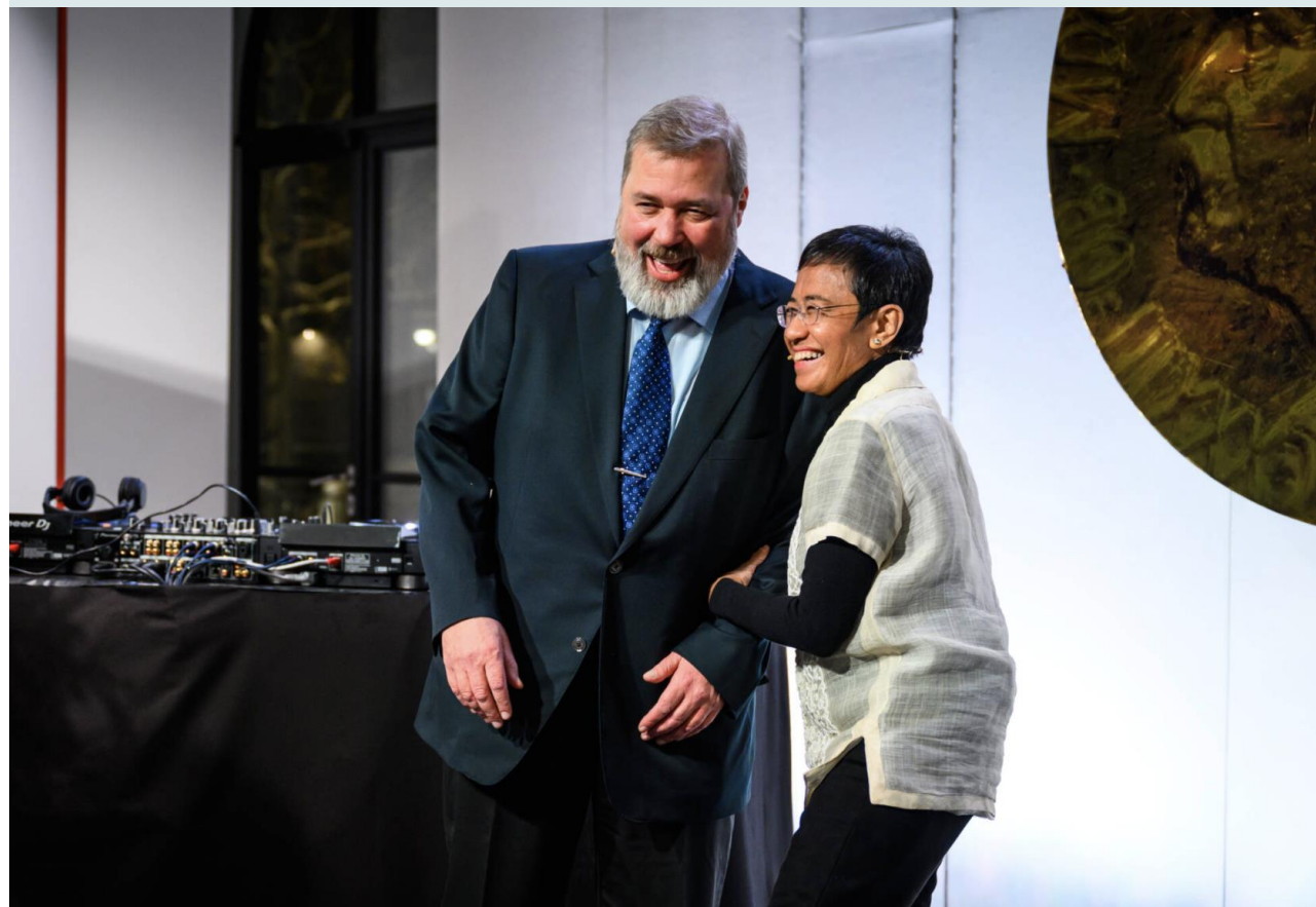
The year's Peace Prize