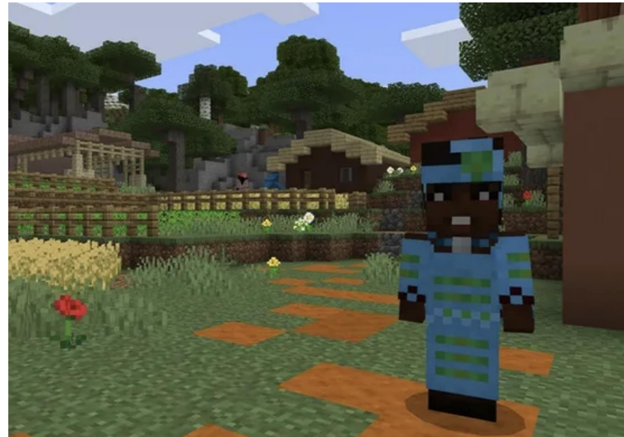
The Peace Prize and its history